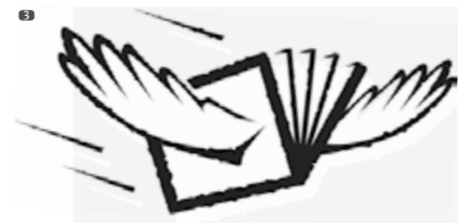
The Tasmanian Writers' Centre motif, ... away with words